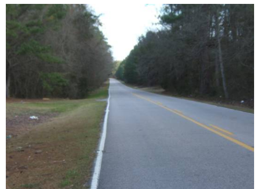
Very few rural roads have shoulders for walking and biking.

Currently, very few bicycle and pedestrian facilities exist in the rural areas. Most bike and pedestrian activity is limited to the narrow shoulder (if any) along the existing highways. Due to the rural dispersion of the population, biking and walking are not often the most efficient or safe option, as compared to getting in a personal vehicle or on transit.